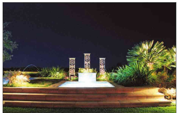
At top, there are five arbors with drip irrigation for the low-water-needs plants. Above, copper panels are a featured design element, cut to match the design of columns near the pool. The one in the center has a faucet that pours water into a square basin, then into a spa, above.