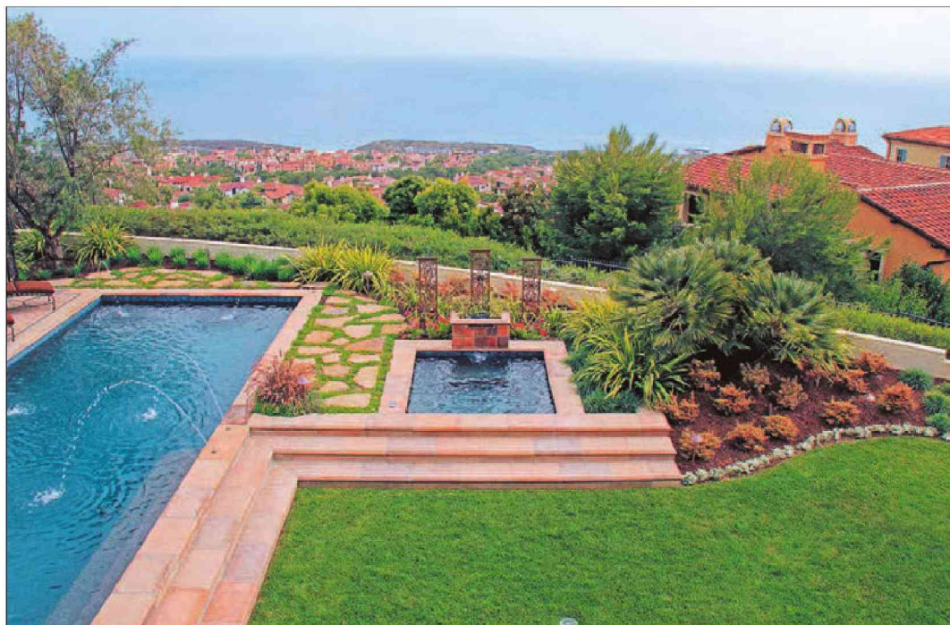
Richard Cohen Landscape worked on the Asner residence for about 10 months. "Our job was to come up with a landscape design to invite people into the house and back yard, swimming pool and spa areas," Cohen says.